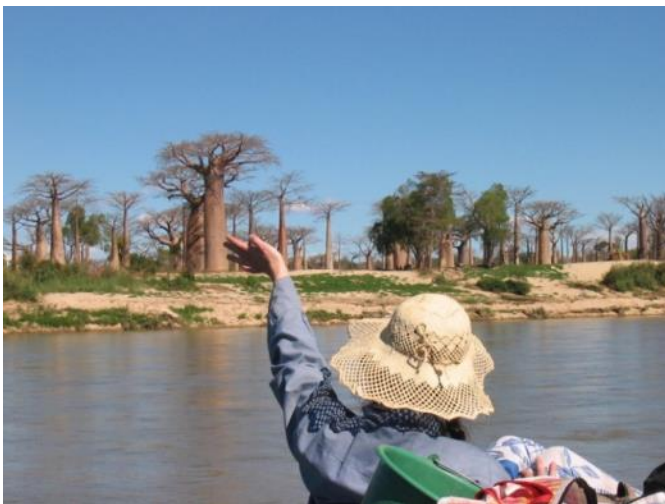
Majestic baobabs along the Mangoky River. (Near Morombe)