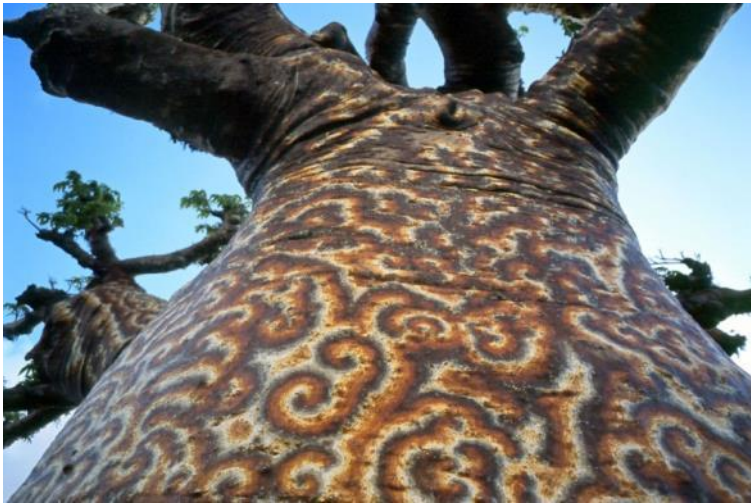
Circa – San Francisco 1967